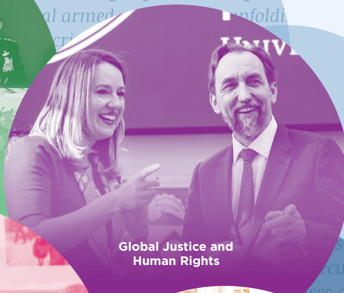
Global Justice and Human Rights